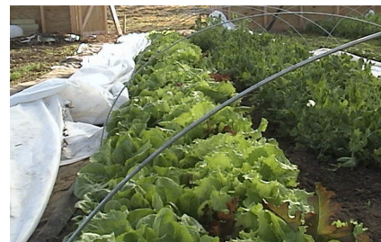
Annie's cold frame as of March 1, 2010