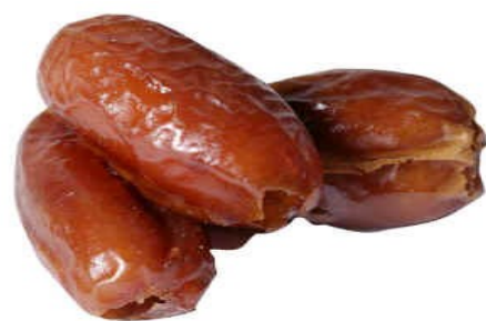
"Dates are 60% sugar"

This is made by drying dates and then grinding them into a powder. Dates are 60% sugar. The crystals contain the same nutrients as dates, and this includes the fiber, potassium, B vitamins, calcium, magnesium, phenols and the carotenoids lutein, zeaxanthin and beta-carotene. However, it is highly unlikely to use enough of it as a