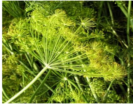
Dill heads like this are used for making dill pickles.

Dill ( Anethum graveolens ) is an annual that grows in rich, well drained soils. It grows very well from seed and doesn't necessarily need to be transplanted. The plant will grow up to 2 to 2 1/2 foot tall and produces a fern like leaf that can be collected and used in many dishes. This is called dill weed. When the plant is allowed to grow to maturity, it will produce a flower head and eventually produce